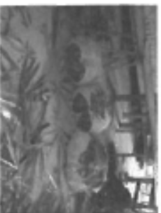
Chamaedorea palms bundled from the forest ready for sorting