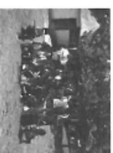
"Uxasatun" - One of the communities where palms have been gathered for years