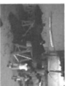
Children playing while their mothers sort palms