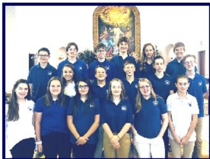
This year's 8th Grade Class!