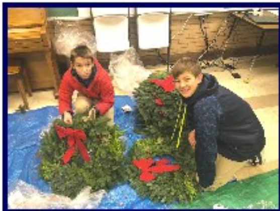
8th Graders assembling wreaths