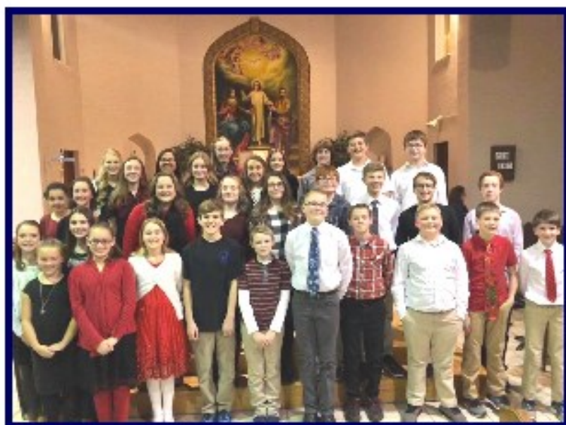
Middle School Christmas Choir Concert

We are thankful for you, our amazing Parish!