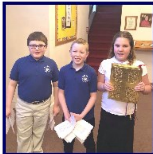
4th grade Mass