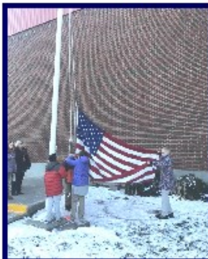
5th grade raising the flag