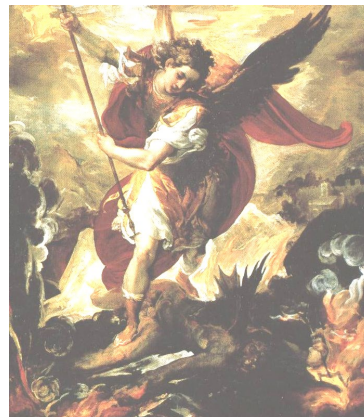
St Michael originally painted by Francesco Maffei