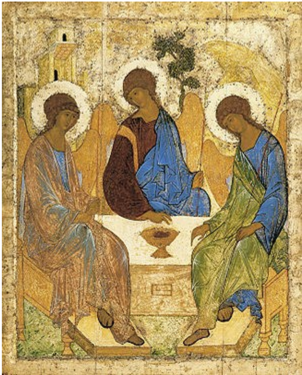
“Trinity” by Andrei Rublev

“The feast of the Most Holy Trinity invites us to commit ourselves in the everyday events in order to be the leaven of communion, of consolation and of mercy.” ~ Pope Francis