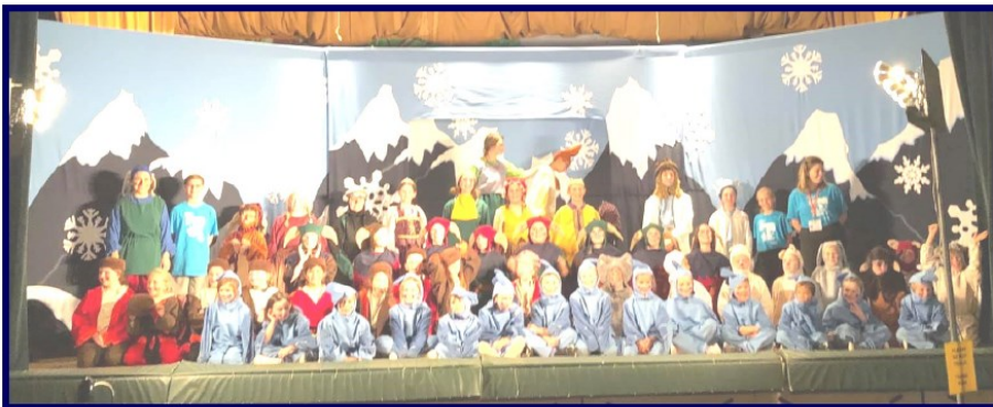
The Snow Queen