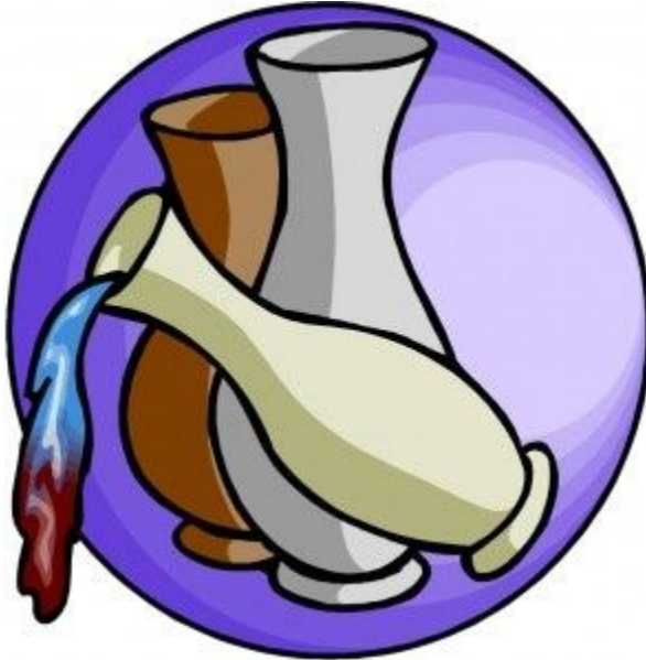
The Wedding at Cana John 2:1-11

"At the beginning of his public life, at the marriage of Cana, when the Son of God works the first of his signs, awakening faith in the disciples, it is Mary who intervenes and directs the servants toward her Son in these words: 'Do whatever he tells you'." ~ St. Pope John Paul II