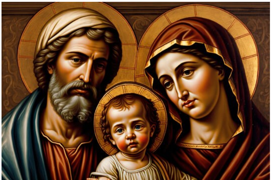
The Holy Family of Jesus, Mary & Joseph

"The charity which burned in the household at Nazareth should be an inspiration for every family. All the Christian virtues should flourish in the family, unity should thrive, and the example of its virtuous living should shine brightly."~ Pope St. John XXIII