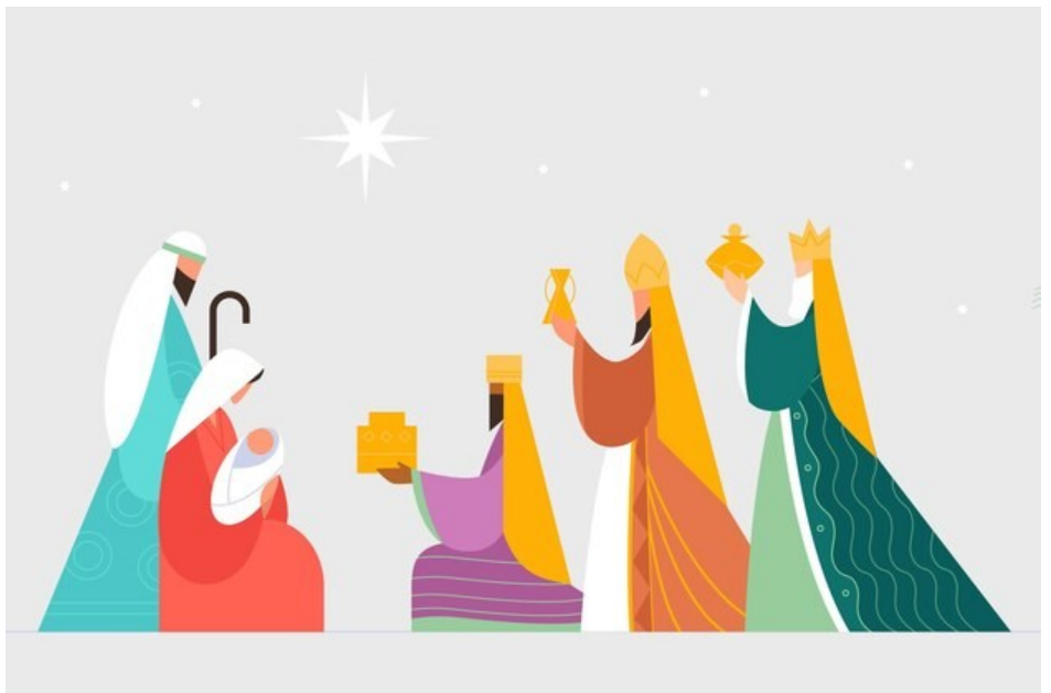
The Epiphany of the Lord